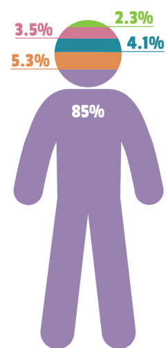
Demographics of all Kirkwood Students (480,948)

Native American or Alaska Native Asian Hispanic or Latino Black or African American White